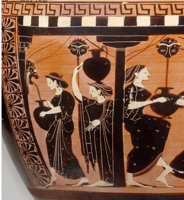
Detail. Priam painter, Hydria with women at the fountain. Ca. 520 BCE http://educators.mfa.org/ancient/water-jar-hydria-women-fountain-64617